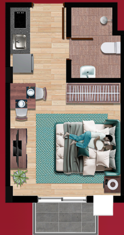
STUDIO UNIT 23.00sqm