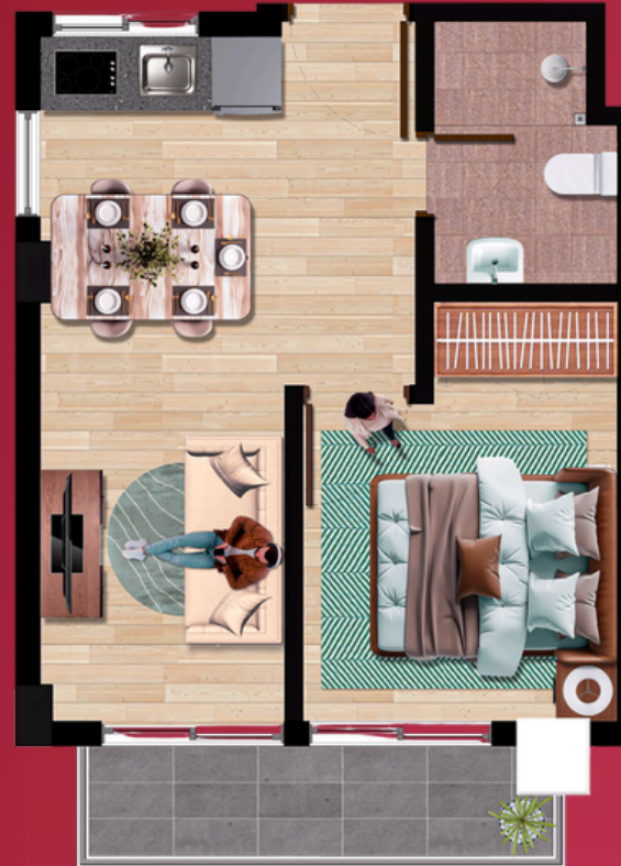
STUDIO UNIT 34.00sqm