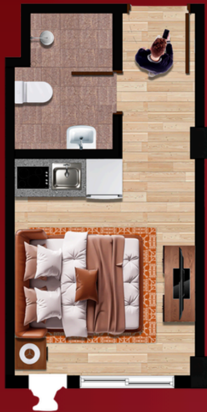
STUDIO UNIT 18.00sqm